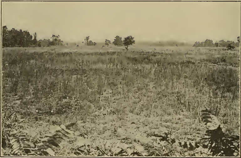
FIG. 7. Edaphic prairie; North Haven. The predominating plant is Andropogon scoparius . The dark patches near the center of the picture are shrubs— Myrica asplenifolia and Myrica carolinensis . All of the herbaceous species listed on page 189 could probably be found here.

Tufts of bunch grass ( Andropogon scoparius ) are always more or less in evidence on these barrens. At first widely scattered,